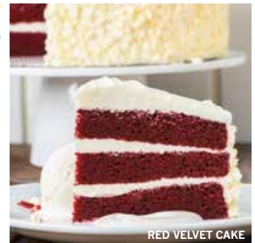
RED VELVET CAKE

All menu items and prices subject to change.