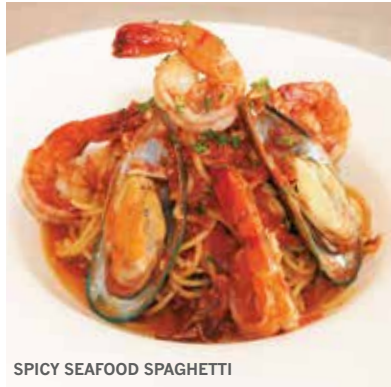
SPICY SEAFOOD SPAGHETTI

Sautéed applewood smoked bacon tossed in a Parmesan cream sauce.