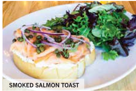
SMOKED SALMON TOAST

Honey vanilla yogurt, granola, raspberry compote with fresh strawberries and blueberries.