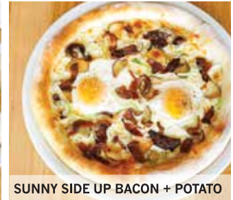
SUNNY SIDE UP BACON + POTATO

SUNNY SIDE UP BACON + POTATO PIZZA 16.99