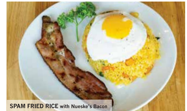
SPAM FRIED RICE with Nueske's Bacon