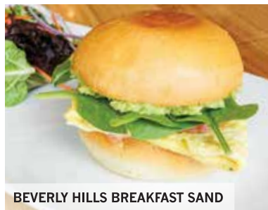
BEVERLY HILLS BREAKFAST SAND