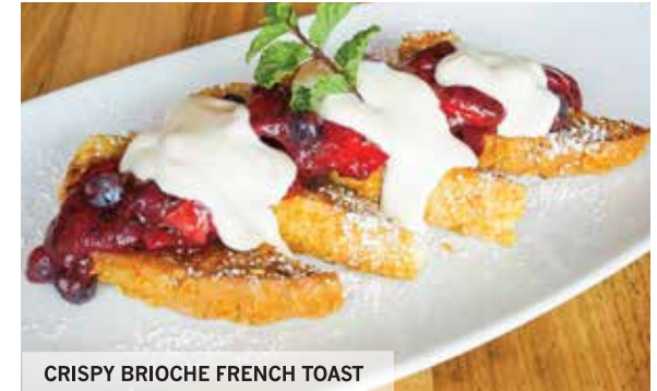
CRISPY BRIOCHE FRENCH TOAST

3 fluffy taro pancakes served with ube paste and macapuno strings. Served with coconut syrup.