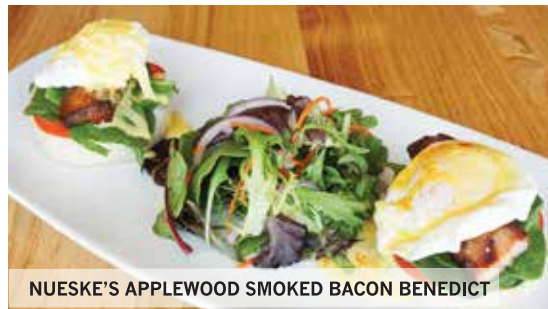
NUESKE'S APPLEWOOD SMOKED BACON BENEDICT

NUESKE'S APPLEWOOD SMOKED BENEDICT 20.99