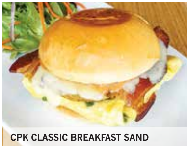
CPK CLASSIC BREAKFAST SAND