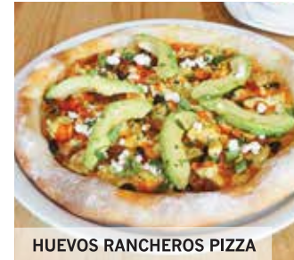
HUEVOS RANCHEROS PIZZA

Extra virgin garlic olive oil, Mozzarella, Romano, shaved mushrooms, sautéed spinach, grated Parmesan and fresh cracked pepper and topped with an egg and grated Parmesan.