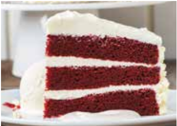
RED VELVET CAKE - Whole Cake 100.00