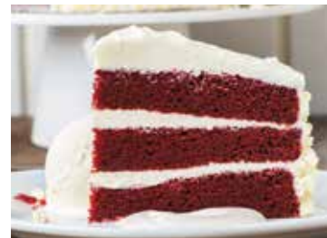
RED VELVET CAKE - Whole Cake 100.00