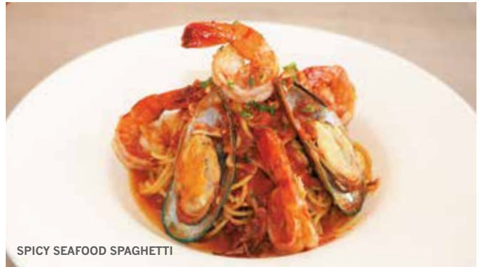
SPICY SEAFOOD SPAGHETTI